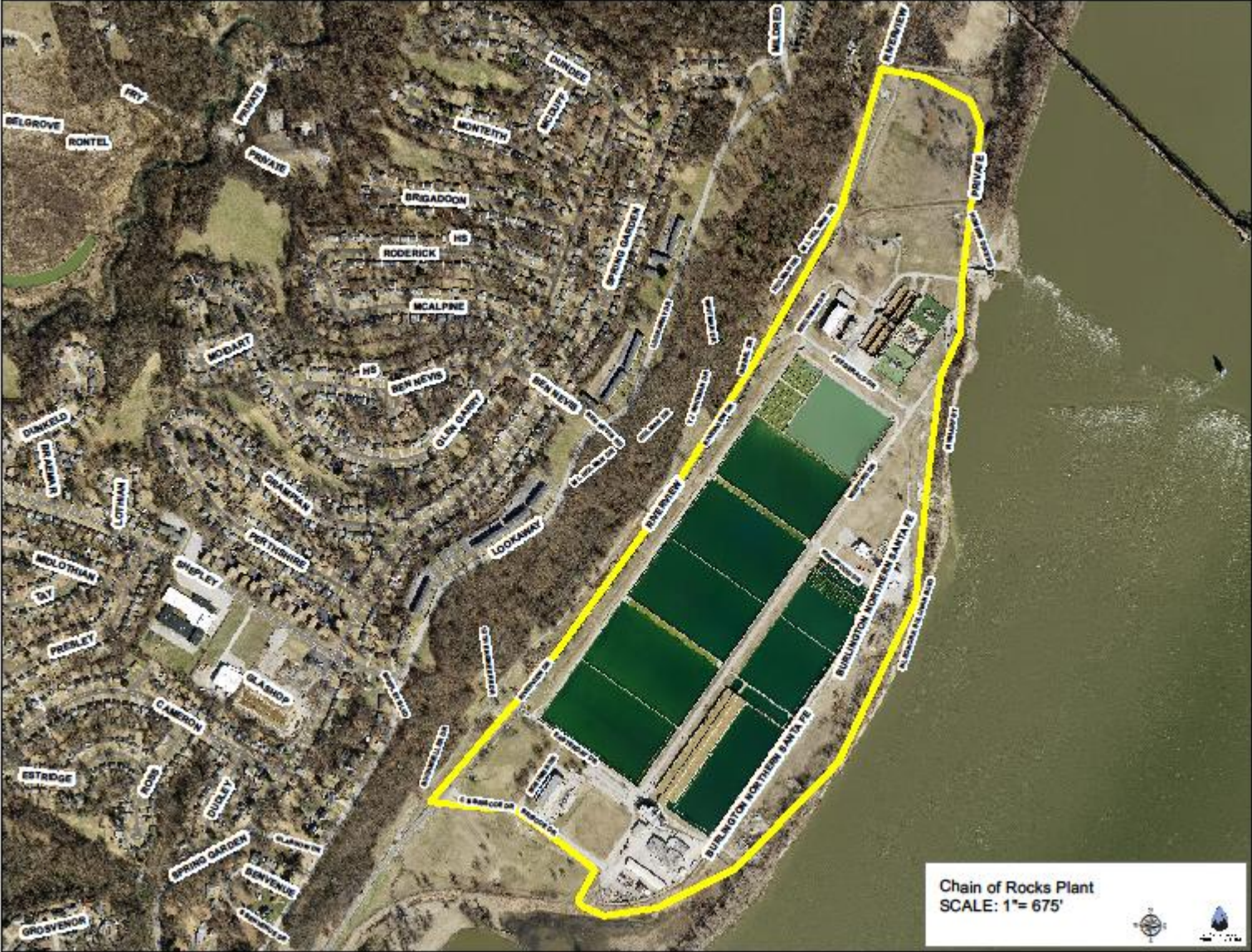
Chain of Rocks Plant SCALE: 1"= 675'